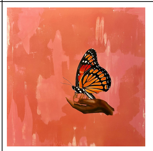
'Evolve' | Dorvilier Olivier Acrylic On Canvas, 30x30", 2022 Individually $1,500 set $2,500