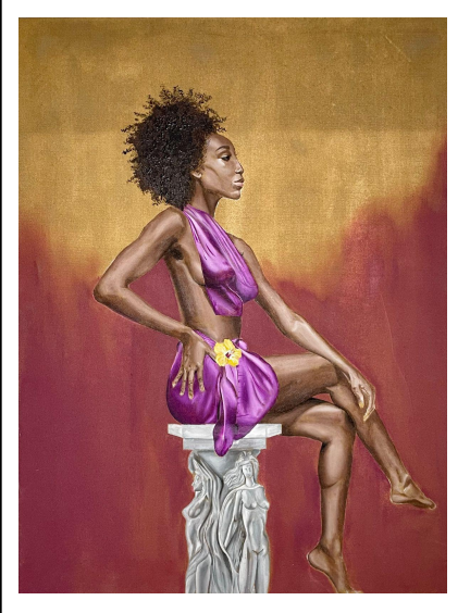
'Creme Brulee' | Dorvilier Olivier Acrylic On Canvas, 2021 Original Unavailable, Prints $500