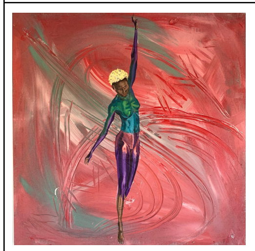
'Majestic' | Dorvilier Olivier Acrylic On Canvas, 3x3', 2019 $4,500