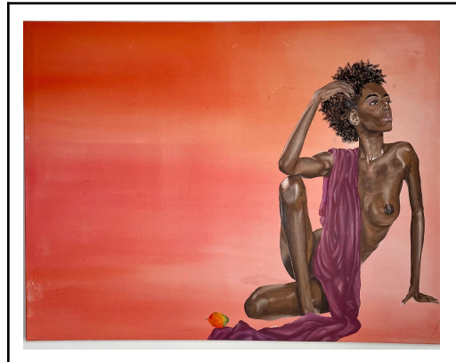
'Mango Sorbet' | Dorvilier Olivier Acrylic On Canvas, 2x3', 2021 $4,500