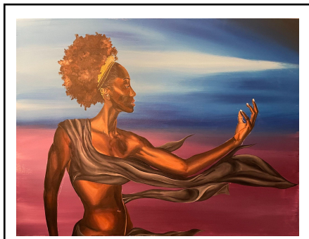
'Rise Up II' | Dorvilier Olivier Acrylic On Canvas, 4x3', 2022 $10,000