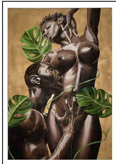
'UpLift' | Dorvilier Olivier Acrylic On Canvas, 2x3', 2019 $6,000