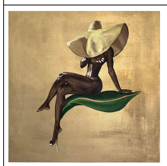
'Tranquility II' | Dorvilier Olivier Acrylic On Canvas, 3x3', 2020 $5,000